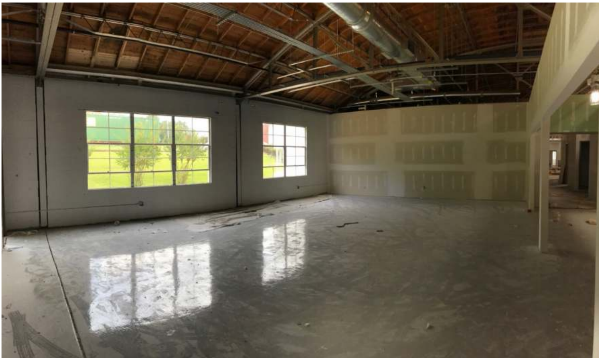
A Base Camp classroom. Distance-learning video-conferencing system coming next week!