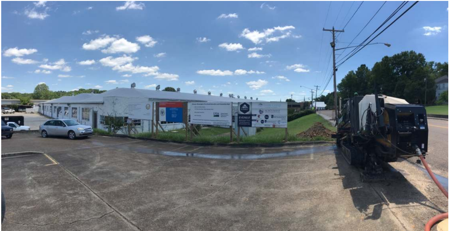
One of the most exciting days, CSpire Fiber completing their 12 mile (underground) run to Everest!