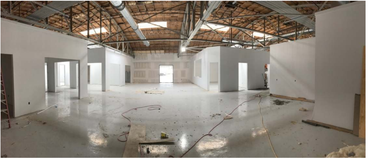
Walls, floors, wiring, skylights, hvac, plumbing... paint going up now.