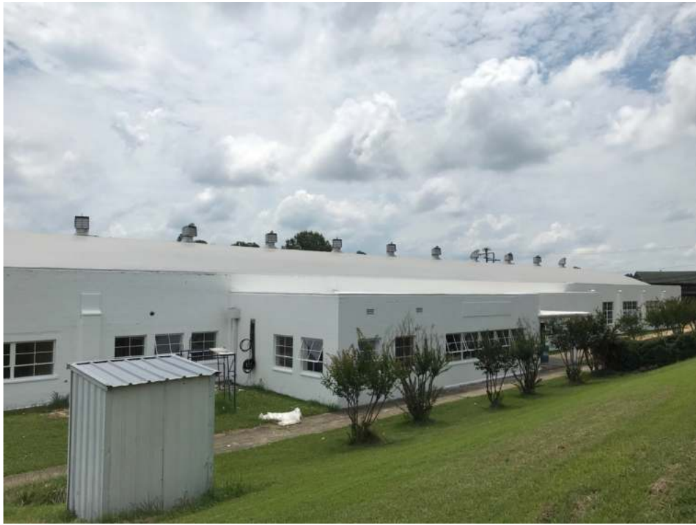
New roof, windows, and paint on the outside.